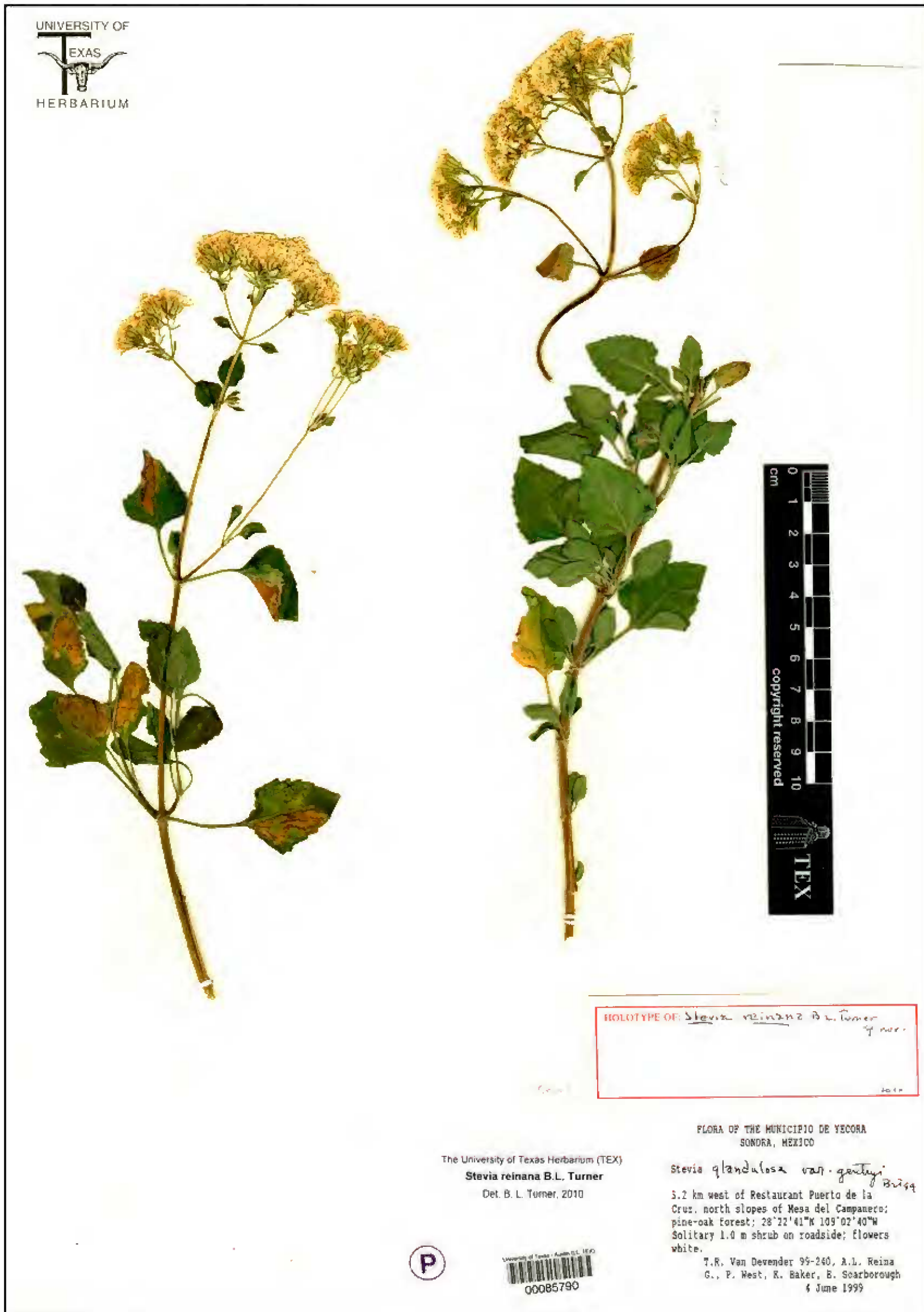
Fig. 1. Stevia reinana (holotype).